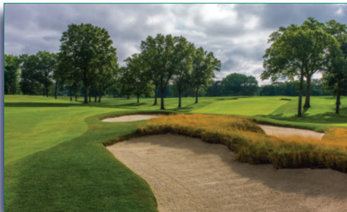
Cover: Siwanoy Country Club